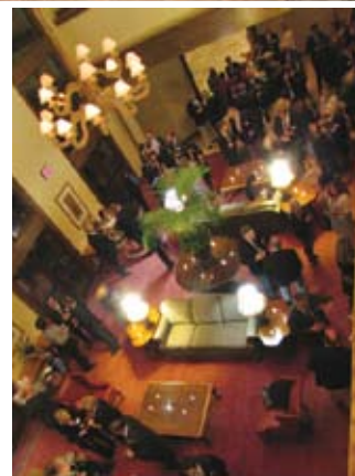
The Country Club of Orlando provided a spectacular setting and its staff extended exemplary service during the Awards event.